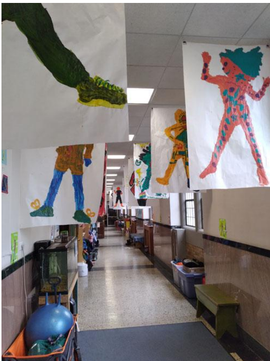
All the full-body portraits hang as banners, filling the hallway with life and color!