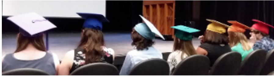
The TCS graduating class of 2019 chose rainbow-themed cap and mortar in their group commitment to the value of accepting every individual's uniqueness.

In addition to class group projects, each eighth-grader completes their own "Capstone Project," which is a major undertaking of planning, research, and execution on a topic of their choice. The Capstone process requires each student to create a website about their project, meet with both their teacher and an adult mentor at regular intervals, and keep a blog as their project plans unfold. The final step