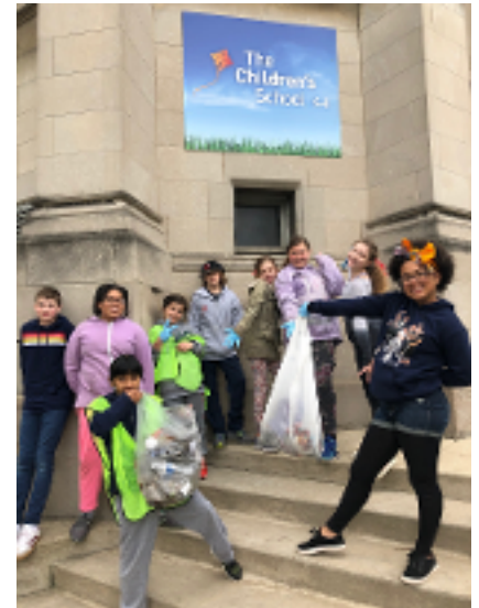
Sixth-graders help out in our "Adopt-a-Block" effort

"One of the focal points of our progressive education program is also social justice. As students learn about social justice concepts and the distribution of resources in a community, concern for the environment frequently forms the bedrock of class project topics. Additionally, we look for ways to incorporate environmental issues into existing projects that may not have an overt connection to environmental studies. Below are a few ways we as a school community are moving toward producing less waste and fostering learning and a sense of stewardship for the environment in our students: