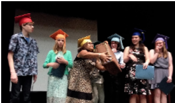
Traditional passing of the suitcase -- full of 8th graders' advice for next incoming class on how to survive 8th grade.